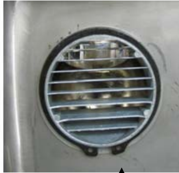
Universal nozzle has open-ended snap-ring washer