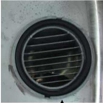
Old-style nozzle has continuous collar